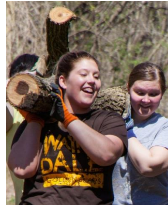
Members of the Youth Foundation participate in community service activities throughout Wayne County.

Since our founding 45 years ago, the Foundation has partnered with individuals, families, businesses, and nonprofits in Wayne County to address the community’s most pressing needs. Together, we can direct our efforts where we can have the most positive impact – today, tomorrow, and forever.