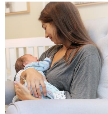
The Women’s Fund is able to support a wide array of programs affecting the lives of women in Wayne County. One such project is the Electronic Fetal Monitoring (EFM) Certification Initiative at Wooster Community Hospital. EFM allows the baby to “communicate” while in the womb and is an effective tool in determining the health of the baby and mother during the labor and delivery process.